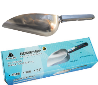
326.xxx 不銹鋼稱重飼料勺 S/S feed scoop