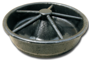
810.005C 鑄鐵小教槽 Cast iron creep feeder