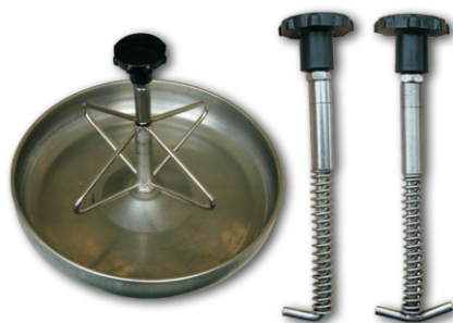
810.006C 不銹鋼倒鉤小教槽(普通型深度5cm) S/S piglet creep feeder