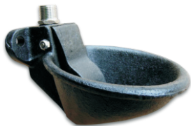
315.000C 鑄鐵豬用飲水碗 Cast iron bowl drinker for piglet

316.027 不銹鋼1/2"大豬用乳頭式飲水器外六角 S/S 1/2"nipple drinker with hex for finishing hogs or sows