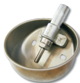
315.060C 不銹鋼豬用飲水碗 (12*6.5cm) S/S piglet drinking bowl