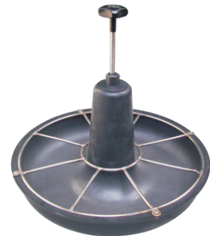
810.009 5kg黑色塑膠倒鉤小教槽, 不銹鋼平分隔網 5kg plastic feeder with flat trough divider