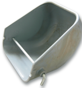
805.001A 塑料大母槽 (390*390*420mm) plastic sow feeder