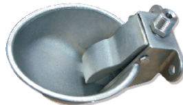
315.061C 不銹鋼豬用飲水碗 S/S bowl drinker for piglet