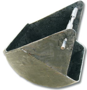
810.304C 鑄鐵大母槽 cast iron sow feeder