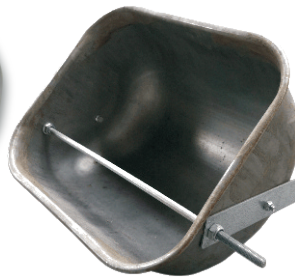
810.304A 不銹鋼#304大母槽 S/S sow feeder(#304)