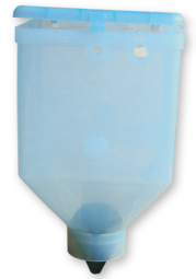
810.320 下料斗(透明) Feed dispenser for Sow(clear)