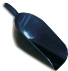
326.000 平口飼料勺 plastic feed scoop