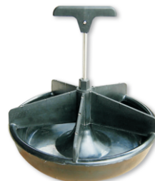
810.008C 塑膠小教槽 plastic creep feeder