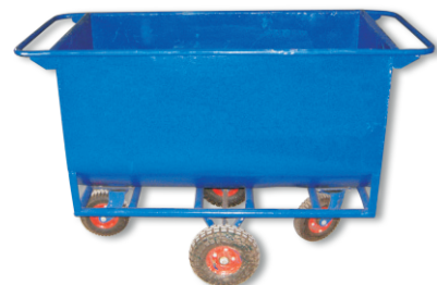
810.318 飼料車 Feeding push car