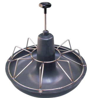
810.010 5kg黑色塑膠倒鉤小教槽, 不銹鋼凸式分隔網 5kg plastic feeder with bulge trough divider