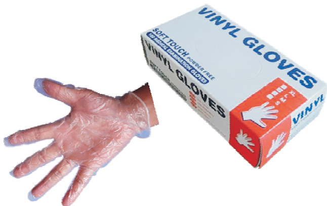
104.015C 一次性無粉手套 (L) Semen collection glove(White,L dize)