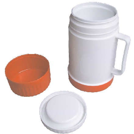
111.002 800ml保温杯 Vacuum cup for semen collection 800ml