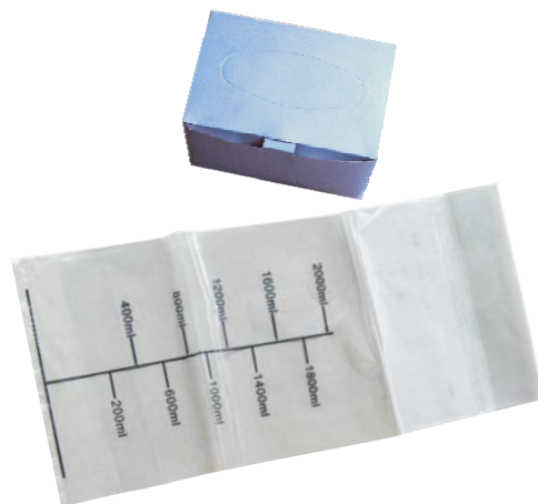
104.0082 2L過濾袋 (100個/每盒) Collectionbagwithbuilt-ingauze filter 2L(100pcs/box)