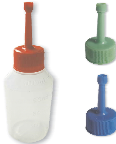
105.050 軟瓶 (100ml) Semenbottle&twistcap(100ml)