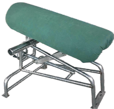
123.006 不銹鋼假母臺 Stainless steel Boar ummy