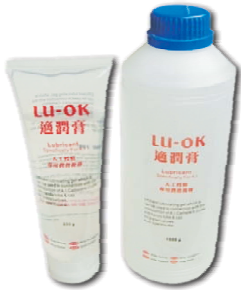
106.017 適潤膏 (人工授精用)-250克 Lu-Ok Lubricant specifically for A.I.250g