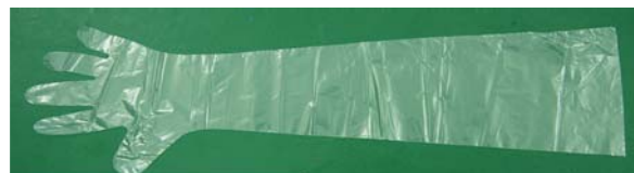
654.020 及肩手套90CM(100PCS/BOX)透明 Shoulder length glove (Clear,length=90cm)