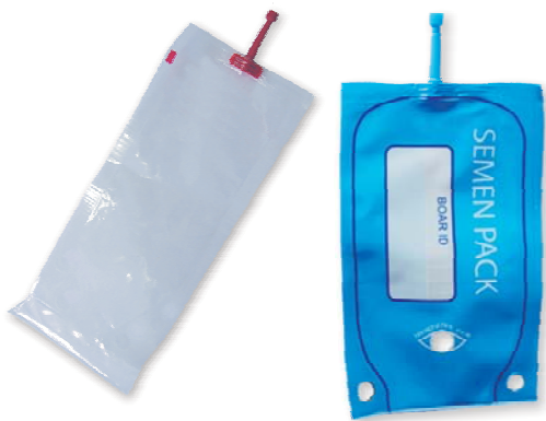
105.055 輸精袋 (透明) Semen bag(clear)