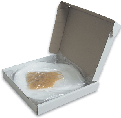
104.021A 精液過濾紙圓形(200張+橡皮筋)整套 Filter for boar semen(200pcs/box)