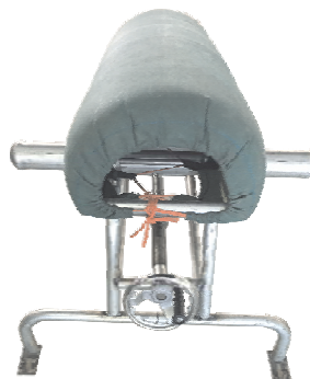
123.007 鍍鋅假母臺 Galvanized Boar ummy