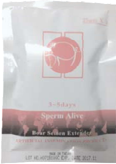
112.401 丹麥稀釋粉 (50g) 雙包裝 Active semen extender(50g 2 pack)