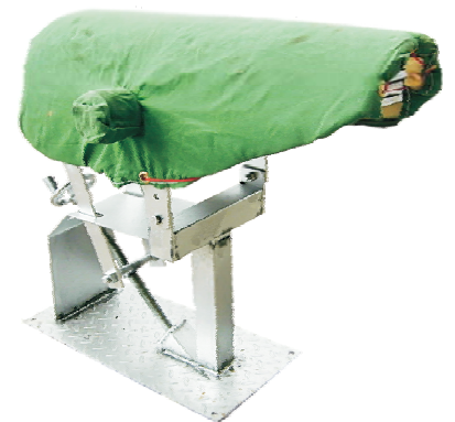
123.004 假母臺 Boar ummy